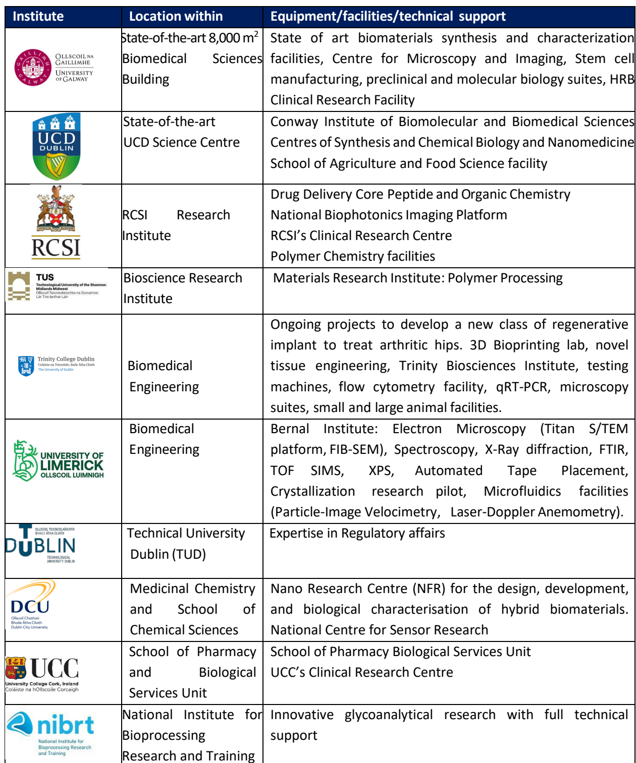
Table 5: Infrastructure and technical support available for Fellows in the host organizations.

counterparts in other universities to identify, manage, and commercialize the IP generated by the MedTrain+ programme. Additional services and support structures each host organization provides include research support, human resource support, computer services, procurement, post award finance support, infrastructure, and technical support (Table 5).