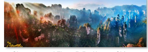
Changsha and Zhangjiajie, Hunan, China