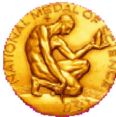
Fig. 2 National Medal of Science, 1979 “For fundamental contributions to applied mechanics, including theory and applications in photoelasticity, package cushioning, piezoelectric oscillators, and ultrahigh frequency vibration”