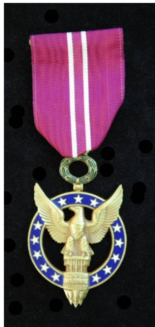
Fig. 1 Presidential Medal for Merit, 1946 “For the development of the proximity fuse, one of the major achievements in the scientific war effort.”