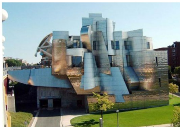
Weisman Art Museum on the University of Minnesota campus