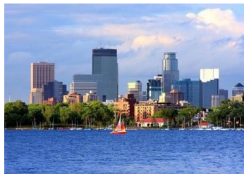
Lake Bde Maka Ska - Minneapolis