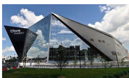
Vikings Stadium - Minneapolis