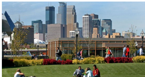
Minneapolis skyline from the University of Minnesota campus

The University of Minnesota is one of the most comprehensive and prestigious public universities in the United States. The campus is located in the vibrant heart of the Minneapolis-Saint-Paul metropolitan area (the Twin Cities), one of the major economic, artistic and cultural hubs in the nation, just blocks from theaters, museums, professional sports venues and endless outdoors recreation opportunities.