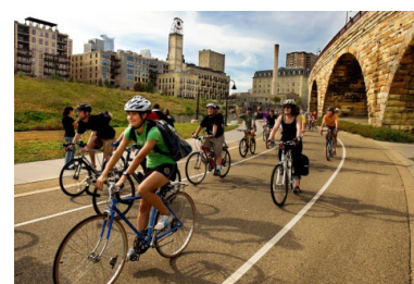
Outdoors activities on the Mississippi riverfront